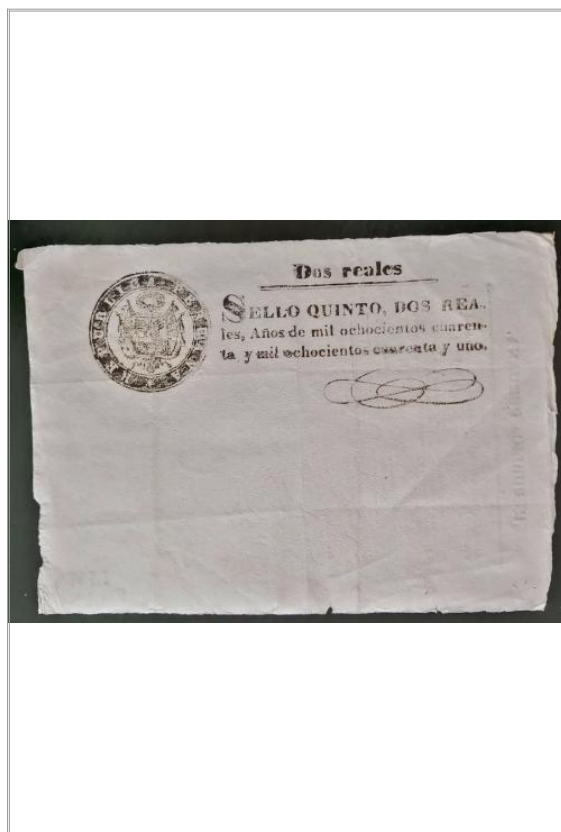
Image: Back View